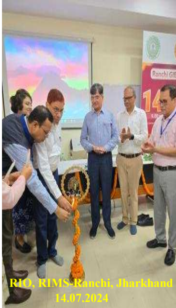
RIO, RIMS-Ranchi, Jharkhand 14.07.2024