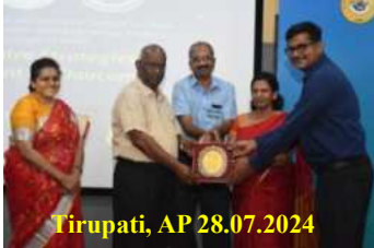
Tirupati, AP 28.07.2024