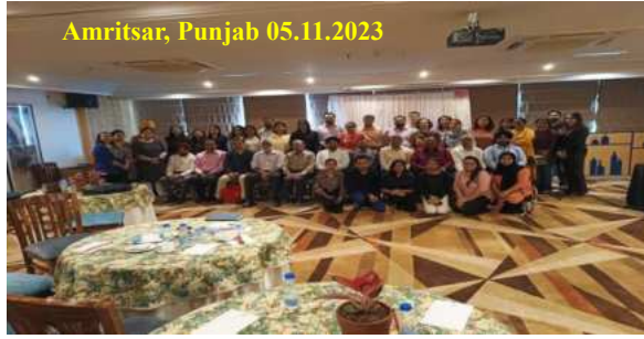
Amritsar, Punjab 05.11.2023