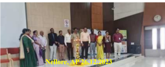
Nellore, AP 26.12.2023