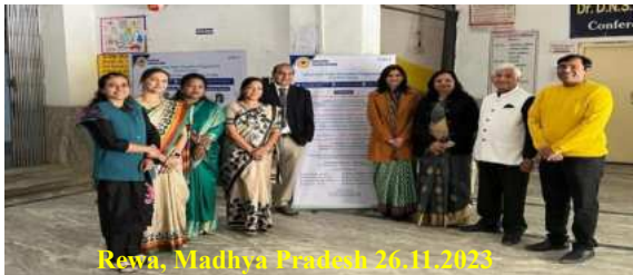
Rewa, Madhya Pradesh 26.11.2023