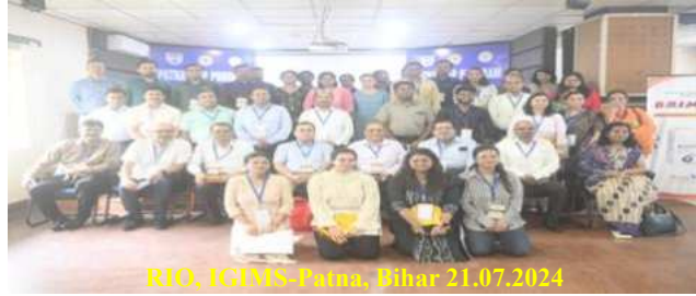
RIO, IGIMS Patna, Bihar 21.07.2024