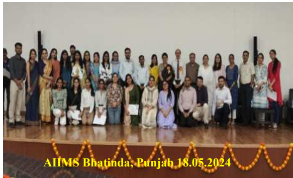
AIIMS Bhatinda, Punjab 18.05.2024