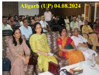
Aligarh (UP) 04.08.2024