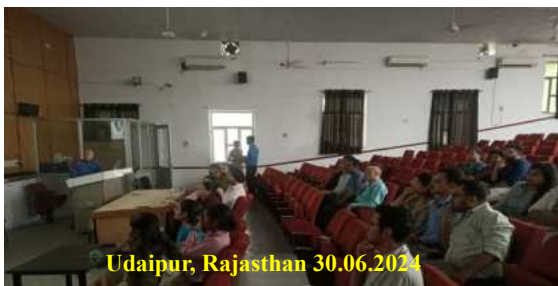
Udaipur, Rajasthan 30.06.2024