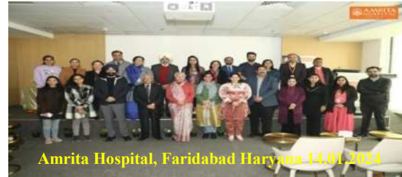
Amrita Hospital, Faridabad Haryana 14.01.2024