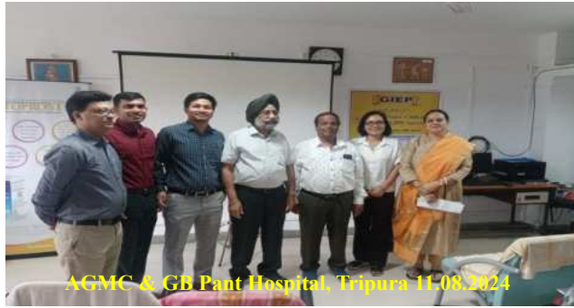
AGMC & GB Pant Hospital, Tripura 11.08.2024