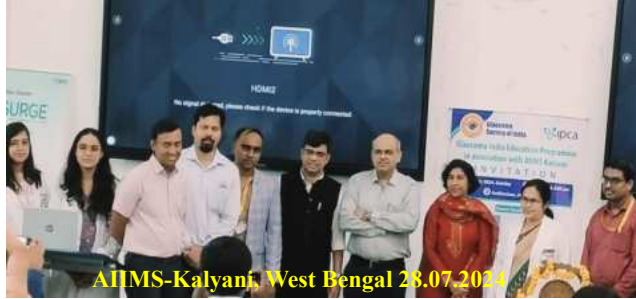
AIIMS-Kalyani, West Bengal 28.07.2024