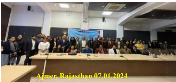
Aimer, Rajasthan 07.01.2024